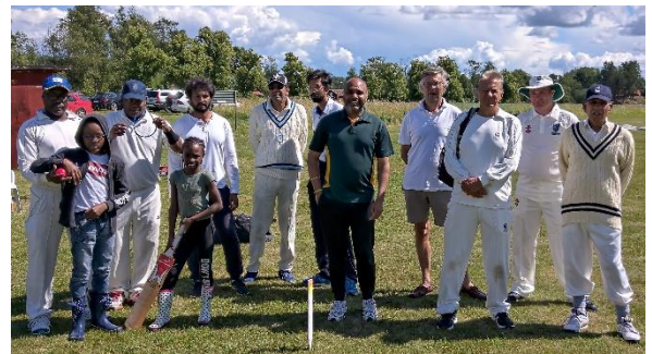
Old Boys Match vs Guttsta, July 2020

With people over the age of 65 defined as a high-risk group, "walking cricket" was put on hold due to the ongoing covid-19 epidemic. The veterans section received additional funding from RF as part of covid-19 support.