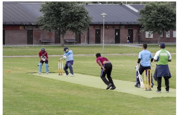
Last Man Stands Match, August 2020