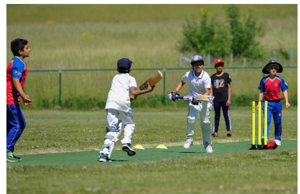
U13 Match vs Alby, July 2020

A first for the U13s in 2020 was also trialling the SCF's modified T20 format for U13 Cricket. Where the U13 team played against Alby and DIF Cricket in several friendly matches using a semi-soft ball (incrediball). These along, with a few Kwik Cricket matches, provided the team opportunity to put into practice all the skills that had been learnt in training.