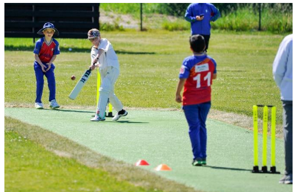
U13 Match vs Alby, July 2020

In November our U8 team was started, where we can have an increased focus on building physical literacy of children while they have fun playing cricket. Only a few sessions were held during the year however there is lots of fun had by all.