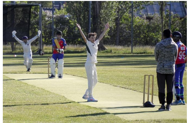
U15 Match vs Alby, June 2020